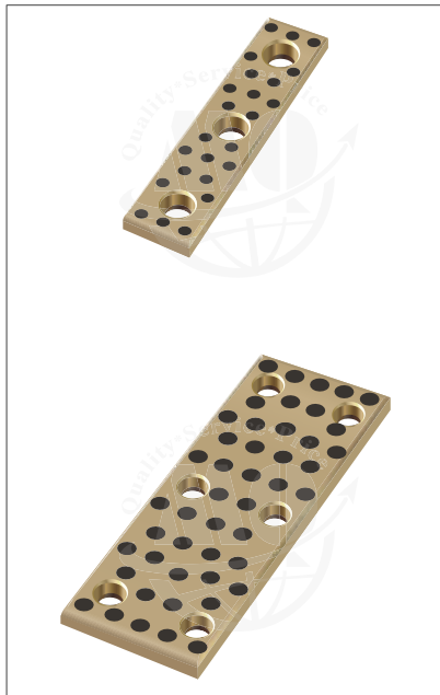
Material: 650#+Graphite 材料: 高力黄铜+石墨