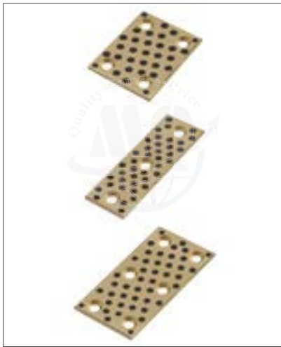
Material: 650#+Graphite 材料: 高力黄铜+石墨